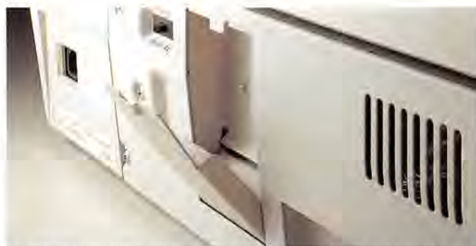
An optional emulation card system lets you select from a variety of printer emulations.

The Ricoh LP4081-R1 runs at a barely audible 55dB, far quieter than any impact printer, so it won't distract and annoy workers even in an open office. All consumable items are packed individually, helping to keep operating costs down to a minimum.